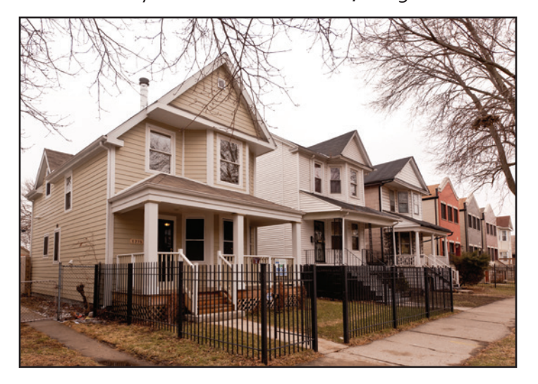
Once a property has been acquired, the land bank would work with third-party, local management groups to accomplish the necessary redevelopment.

The TAP also warned the land bank to be cautious, but smart, in its initial transactions. Isolated, irregular properties are that way for a reason. While the land bank can provide a needed function of connecting interested buyers with available land, the goal of the