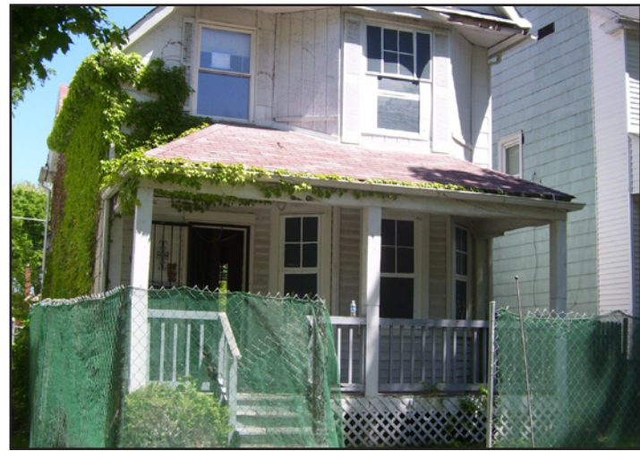
Vacancy and foreclosure effect both multifamily and single family homes, decreasing the value of neighboring homes and reversing community development goals.