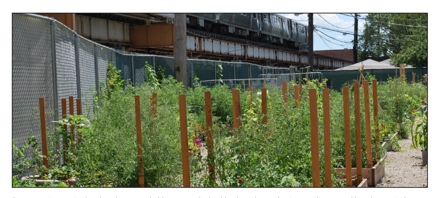
For properties acquired under a long-term hold strategy, the land bank might employ intermediate uses, like urban agriculture or gardens.

land bank should not be to amass the largest number of properties, but to stabilize the market by being a catalyst for reuse, redevelopment, and repurposing of properties.