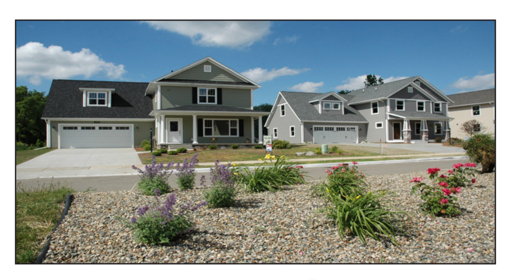
The land bank could complement existing local efforts, and stabilize communities throughout the county.

The land bank would fulfill a critical purpose – to return valuable resources to productive use, whether new housing, economic development, open space, or other uses.