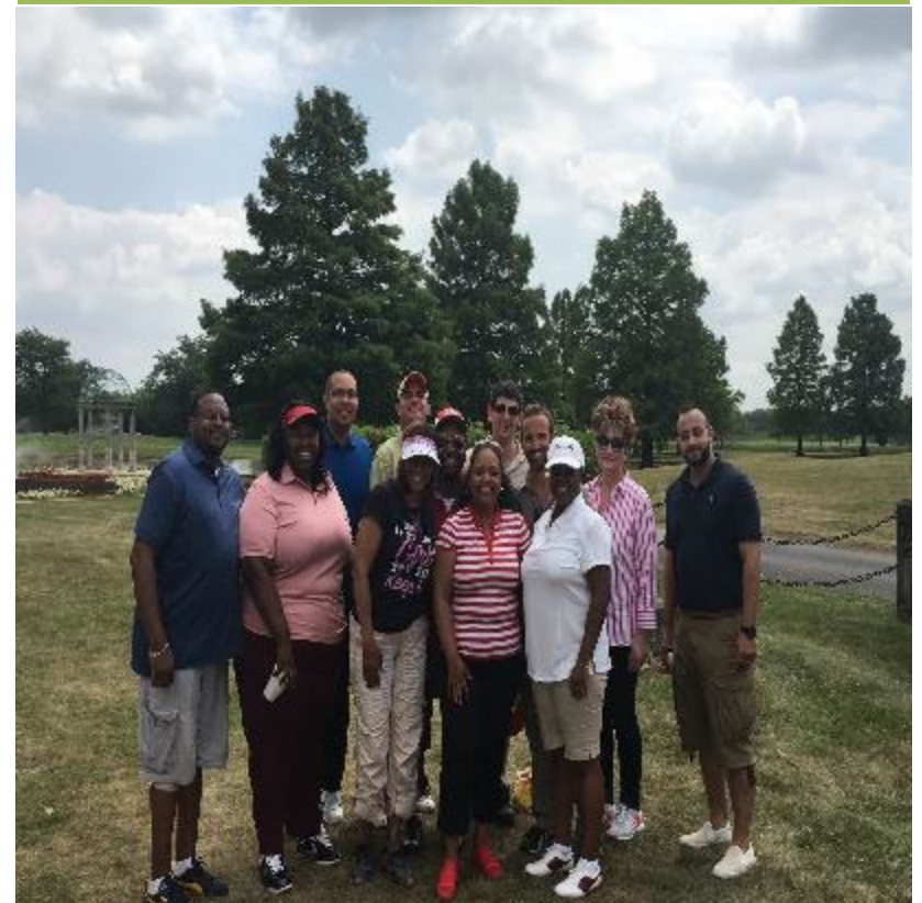
CCLBA staff at the Dearborn Realist Golf Outing